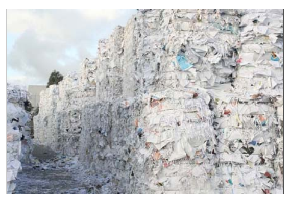
Stacks of paper wait to be recycled.

Gone are the days of pressing words through powdery sheets of black and red carbon paper. Yet the association of carbon to paper has perhaps never been more intimate than it is today. We're referring, of course, to the relationship between paper consumption and the production of that oh-so-prevalent greenhouse gas--carbon dioxide.